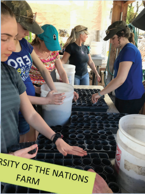
UNIVERSITY OF THE NATIONS FARM