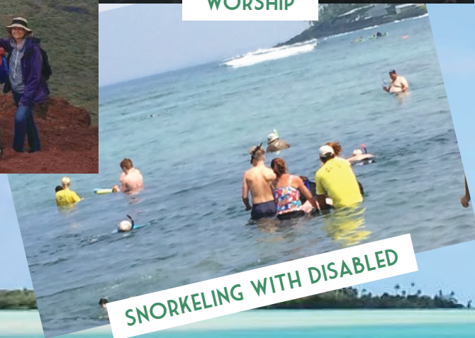
SNORKELING WITH DISABLED

In May, our Kona Team (nine students and 3 chaperones) spent 12 days in Kona at the YWAM ships base. We lived at the base, experienced YWAM life (worship, DTS classes, prayer night, meals, etc), participated in local ministries (children's festival for the families that were evacuated from the volcano, Missionary Kids at the University of Nations base, after-school program for underprivileged kids, snorkeling for the disabled, and a prayer walk), helped out where needed (UofN Natural Farm, painting the prayer room at the ships base, painting pylons at a local pier, cleaning up a local harbour, helping out at a cultural festival), and enjoyed Hawai'ian culture (Island Breeze worship service, Pu'uuhonua O Honaunau - Place of Refuge), and God's beautiful creation (Mauna Kea Observatory, a coffee plantation, and beautiful beaches with tons of colourful fish, sea turtles, eels, reef sharks, and even a manta ray! The tidal pools were pretty cool too. God truly blessed us with His presence, His people, His beauty, and His creativity.