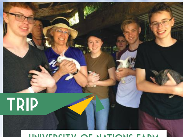
UNIVERSITY OF NATIONS FARM